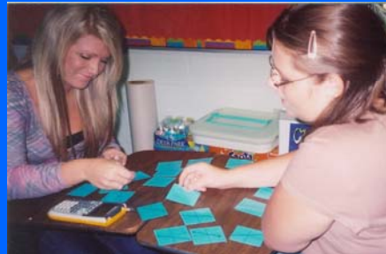
Providing Hands-on Activities to increase student understanding

Aligning Math Curriculum with Program of Studies and Core Content 4.1