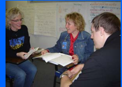
Planning and Reflecting with teachers to maximize learning

Teachers and Students Working With Our Math Coach to Reach the Goal: PROFICIENCY!