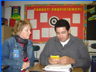
Working with students to individualize instruction

Teachers and Students Working With Our Math Coach to Reach the Goal: PROFICIENCY!